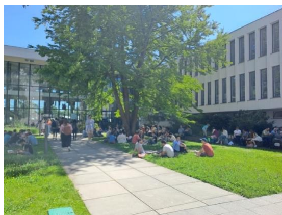
Lunchtime at the Berlin ICN.